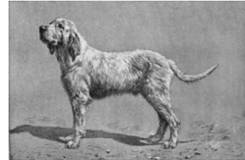
Griffon Vendéen Stentor

A third French hound was the rough-coated Griffon Vendéen, originally a cross between the smooth Vendéen hound, the Griffon fauve de Bretagne, and the Griffon de Bresse. The smooth Vendéen hound had developed from crosses of earlier French staghounds, in particular the chien blanc and lemon-and-white Poitou hounds. These hounds may have been introduced into Otterhound packs in the period 1861-1870, but there is no direct evidence.