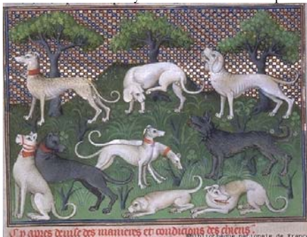
Five breeds of French hounds

most likely different breeds and not simply different strains of the same breed. The Talbot undoubtedly derived from Norman sources in France. The question is whether it originated in France and was then introduced into England after the Conquest, or whether it was first bred in England from Norman imports, purportedly by one John Talbot, the Earl of Shrewsbury. The Talbot was essentially white, according to legend, but may have consisted of a number of different colors owing to various crosses. The white strain of Talbot, if in fact a distinct type, may have had something in common with the white strain of the St. Hubert, a possible source. As for the Norman Hound, it may