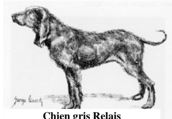
Chien gris Relais

The existence of a rough otter hound at the beginning of the millenium is far from certain. Rough hounds referred to as Irish hounds were presented to Henry II by the Earl of Gloucester in the 12 th century. It is not known whether these were the ancestors of the Irish Wolfhound, or something more akin to the ancient rough Welsh hound. On the other hand, the early chien gris de St. Louis , a grayish rough hound with reddish undertones, was the main hunting hound in the French royal kennels from 1250 to 1470. Some of these hounds may have found their way into the royal kennels in England. Both of these hounds may have been related to the ancestor of the modern Welsh hound, the Celtic hound ( Segusia ). The Welsh hound ancestor at the time of the Norman Conquest was probably a blend of lemon-and-white and tawny red, having derived from crosses of the chien blanc and chien fauve on the Continent. Evidently, this mixture of piebald lemon-and-white with whole fawn or red occurred at a very early date. Whether any of these early rough hounds were used to hunt otter is not clear.