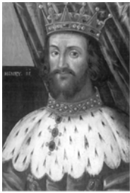
King Henry II

The first mention of otter hunting is attributed to King John of England in 1212, although his father, King Henry II, probably hunted otter as early as 1170. The type of these royal pack hounds is not known, but the Norman ancestry of the Plantagenets leads us to speculate that they were smooth-coated Norman hounds and/or Talbots, and possibly at least one strain of the black and tan St. Hubert hound. The original St. Hubert was supposedly coal black (some authors claim a white strain as well), but by the time of the Norman invasion in 1066, the black and tan strain was the most prominent hound in the St. Hubert Monastery in Belgium. Also about this time, black and tan St. Huberts were reportedly gifted to the Margam Abbey Monastery in Carmarthen, Wales. Descendants of these hounds eventually formed one strain of the Welsh hound called the Gelly (or Gelli) hound.