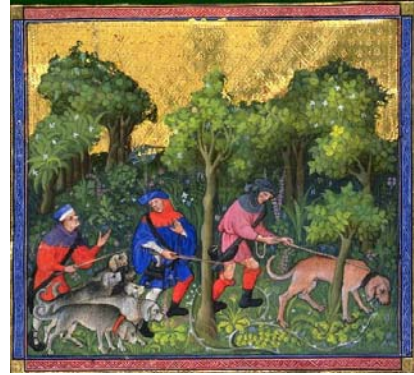
Limier and raches

The Norman Hound and/or Talbot became the classic “ limier ,” or tracking hound, of the Middle Ages, used by royalty to track stag and possibly the otter as well. The Norman Hound, in conjunction with a perhaps distinct breed of tracking hound called the Sleuthound, became the forerunner of the modern Bloodhound, with a possible out-cross from one of the strains of alaunts . Centuries later, the Bloodhound was one of the breeds introduced into the developing Otterhound of the 1800’s.