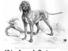
Chien fauve de Bretagne

The first of these was perhaps the Griffon fauve de Bretagne, or Fawn Breton. Sir Walter Gilbey, in his Hounds in Old Days of 1913, informs us that “two rough-coated French hounds of the red Brittany breed” were purchased in 1869 at the National Dog Show, Islington, by a Master of Otterhounds, presumably for use in cross-breeding. This reference is the only evidence supporting a modern direct connection between the Fawn Breton and the Otterhound.